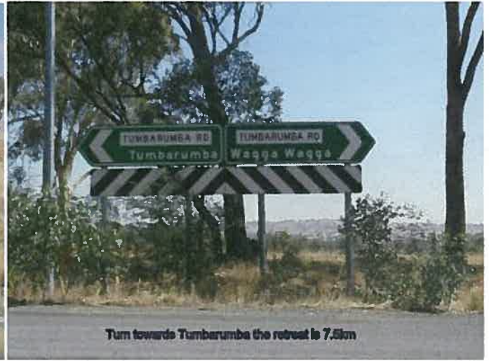
NORTH BOUND ON THE HUME HIGHWAY