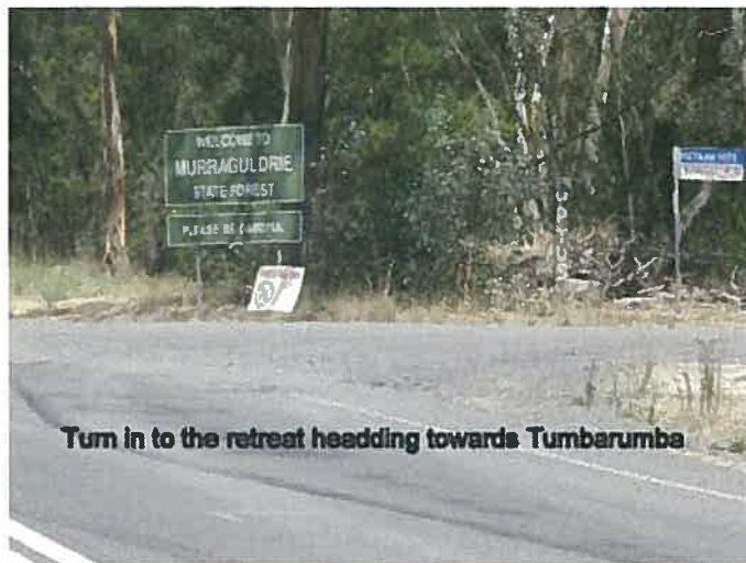
TURNING TO THE RETREAT COMING FROM THE HUME HIGHWAY