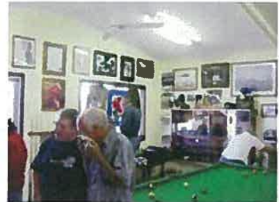
RSL entrance and inside (below)