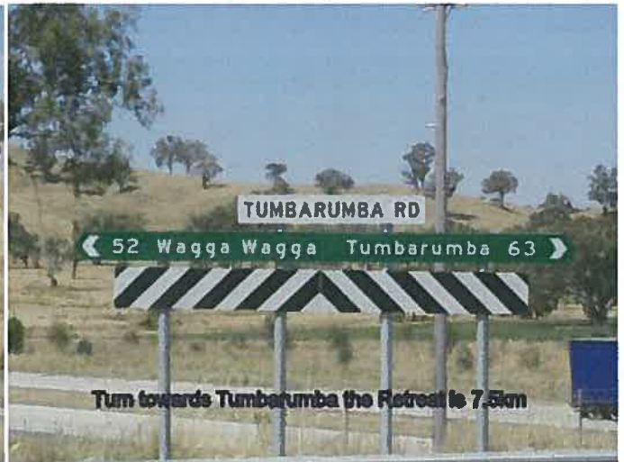
COMING FROM WAGGA AND CROSSING THE HUME HIGHWAY