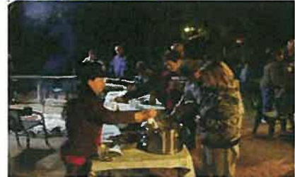
PANDANUS PARK, Cape York, Qld

The quest for inner peace within the veteran community is on-going. Veterans of all conflicts need a place to go to chill out, to meet old and new mates, to be with others who have done the time, walked the walk and talked the talk.